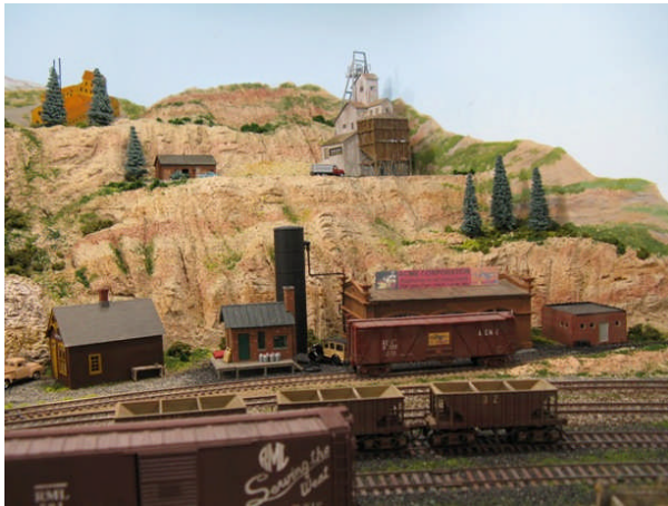
An example where Don used forced perspective, by using smaller scaled buildings in the background to add depth.